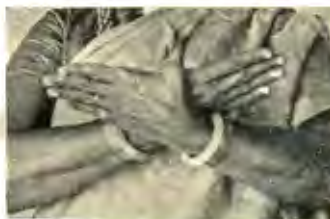
E. GARUDA (Vehicle of Vishnu)