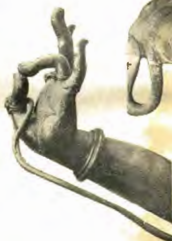
D. Kartari mukha or mayura hand (holding stalk of a lotus), from a Nepalese image.