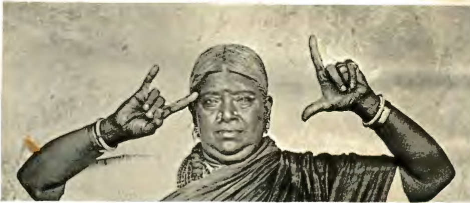
A. EYEBROWS LIKE THE CRESCENT MOON (l. h. candra-kalā )