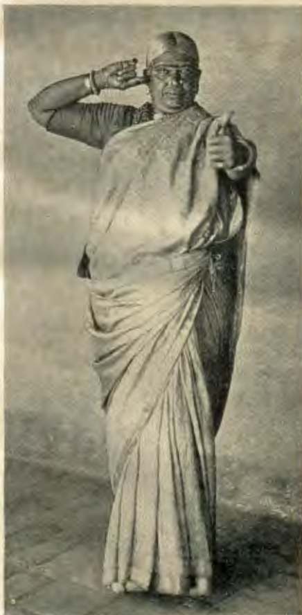
C. SHOOTING WITH THE BOW (l. h. Śikhara)