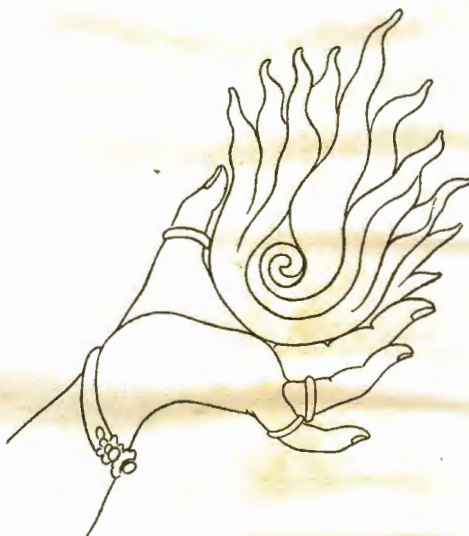
B. Ardha-candra hand, with flame (upper left hand of figure represented on Pl. I).