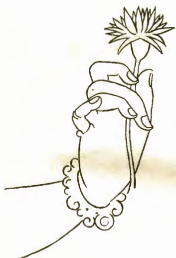
A. Kaṭaka mukha hand with blue lotus (hand of Bodhisattva, Ajaṇṭā).