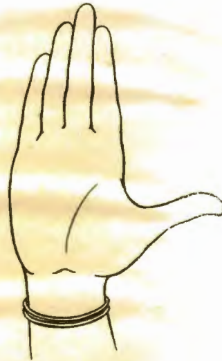
B. Ardha-candra hand