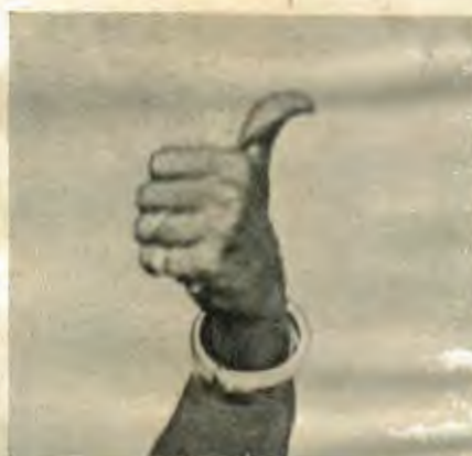
D. Śikhara left hand