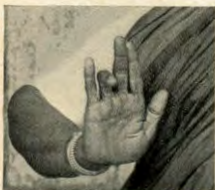
A. Tripatāka right hand