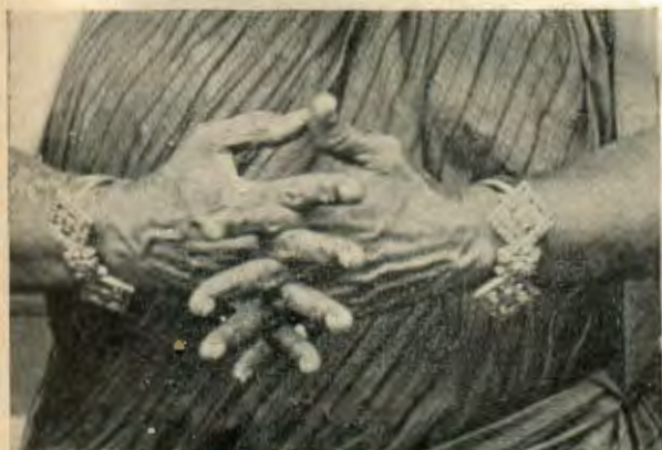
E. Karkaṭa combined hands (a grove of trees)