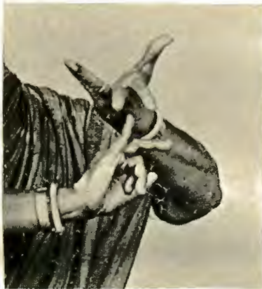
B. RAISING MT. GOVARDHAN