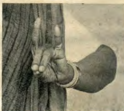
B. Sīṃha-mukha left hand