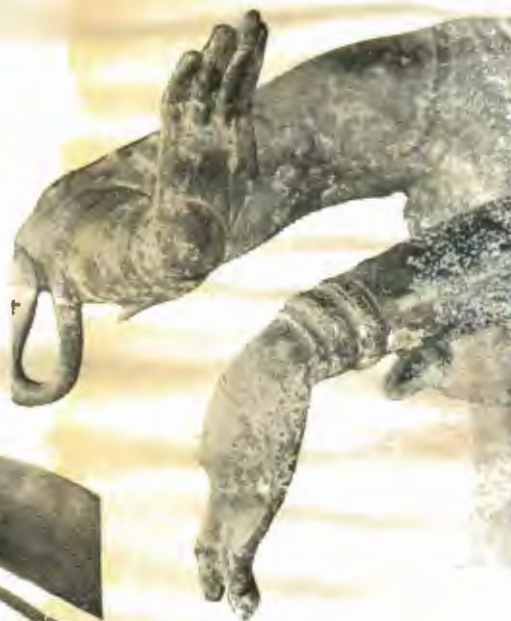
E. HANDS OF A DANCING ŚIVA r. h. Ardha-candra (for paṭāka ) making Abhaya mudrā .