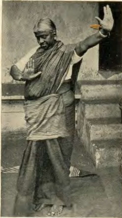
A. AVERSION (Both hands ardha-candra , for pātaka )