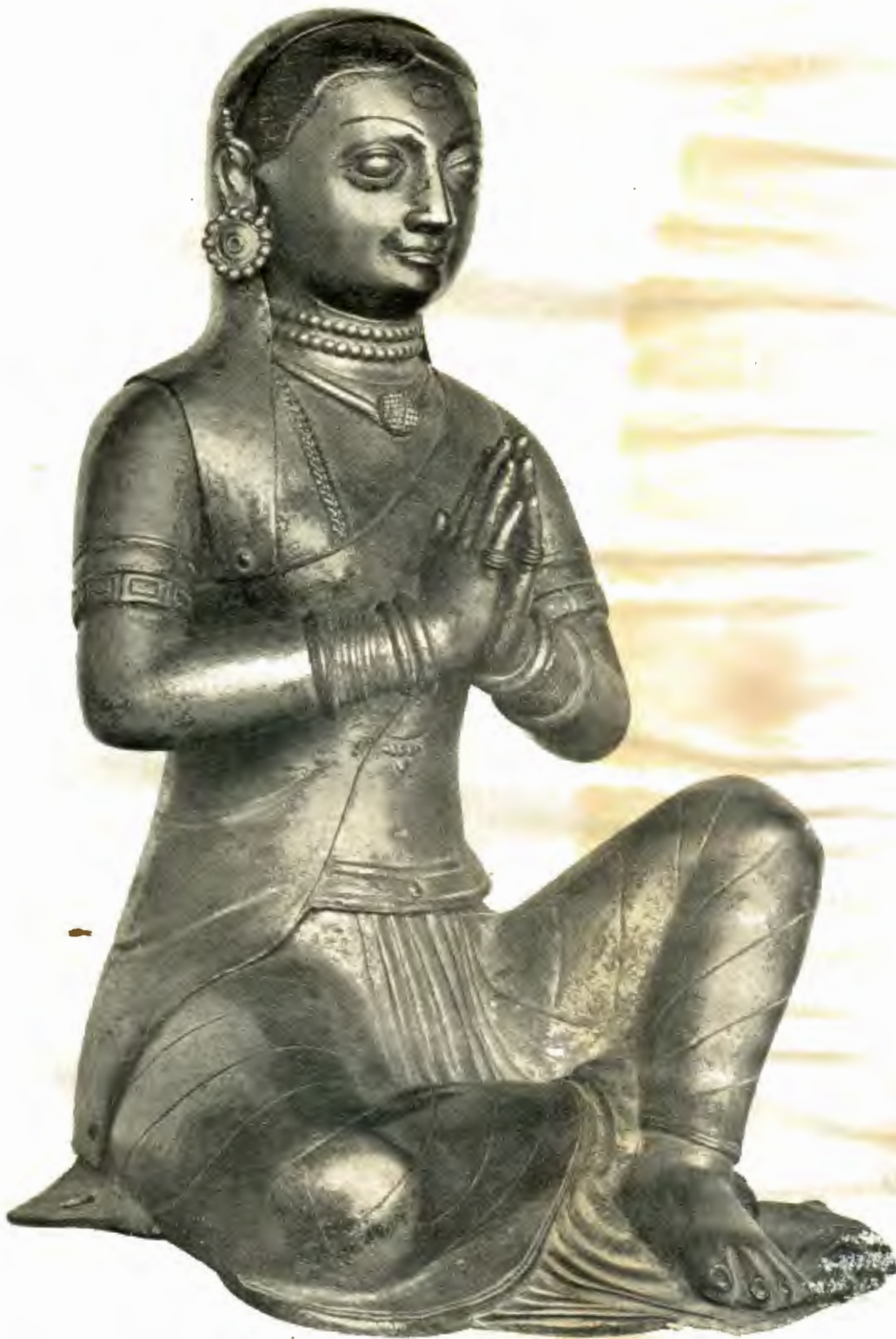
SEATED IMAGE WITH AÑJALI HANDS