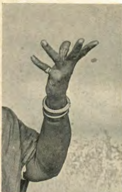
C. Alapaḍma left hand