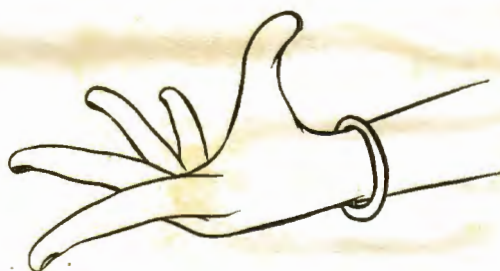
E. Udvēṣṭitālapadma hands.