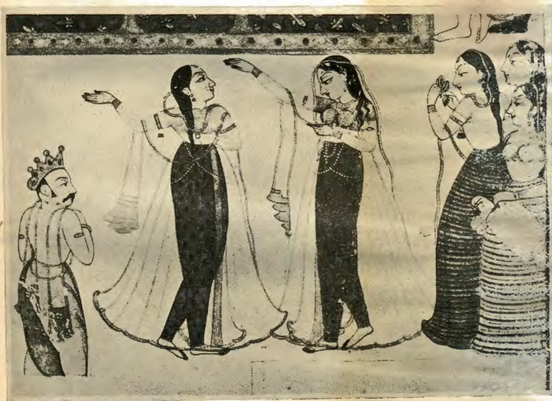
AP SARĀS DANCING

In the Vaikunṭha Sabhā of Vishnu: from an early Kāngrā painting in the collection of Mr. W. Rothenstein.