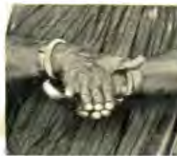
C. THE FISH (Avatar of Vishnu)