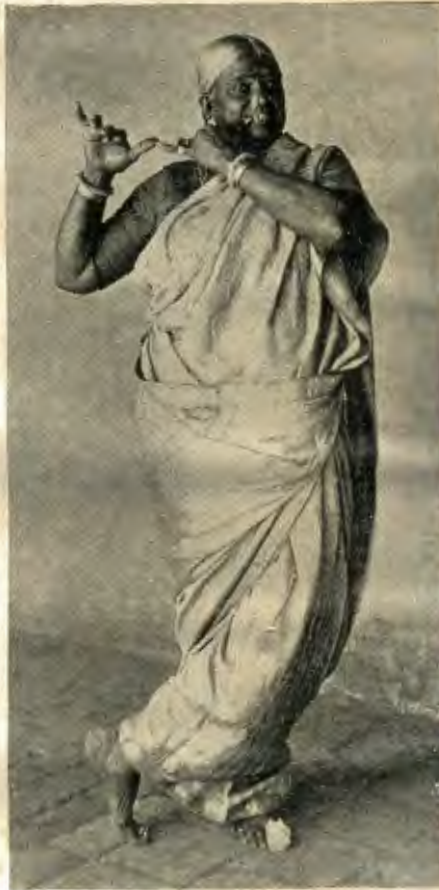
B. KRISHNA WITH THE FLUTE