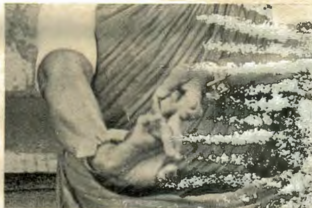
F. Pāśa combined hands (army)