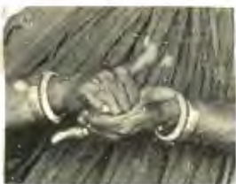
THE TORTOISE (Avatar of Vishnu)