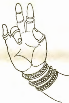
C. Kartar mukha (hand of an image in Madras Museum).