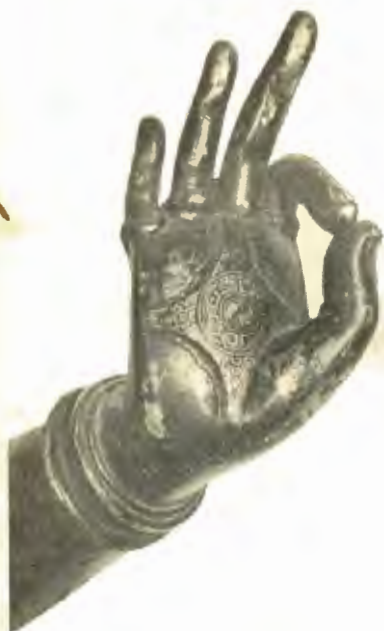
C. Hamsāsya hand, from a Nepalese image.

Seated in lalitāsana, the r. h. tripa- tāka, l. h. holding stalk of lotus. (Javanese, ninth to eleventh century.)