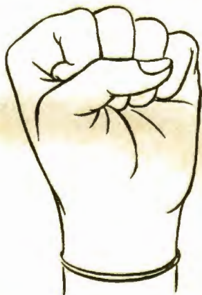
C. Muṣṭi hand