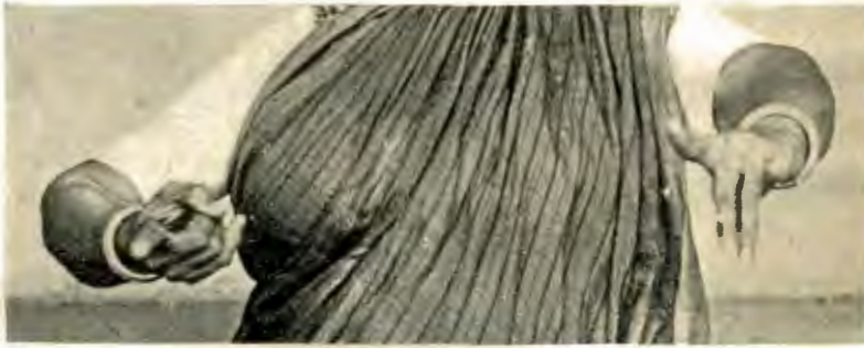
A. r. h. Sūci , l. h. Siṃha mukha : representing Krishna driving cattle.