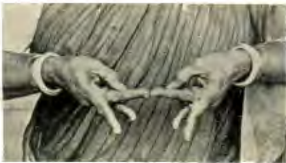
B. A BED