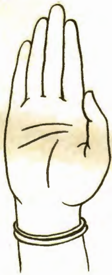
A. Patāka hand