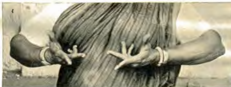
D. BOTH HANDS udveṣṭitālaṣṭadma COMBINED HANDS