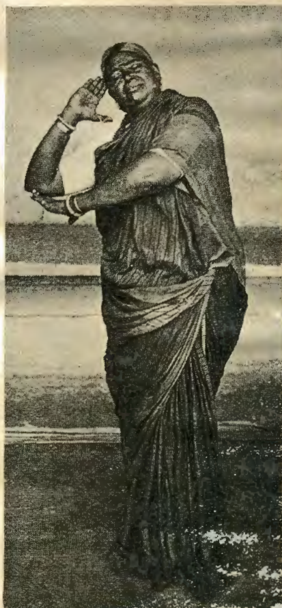
D. SLEEP (Both hands ardha-candra , for pātaka )