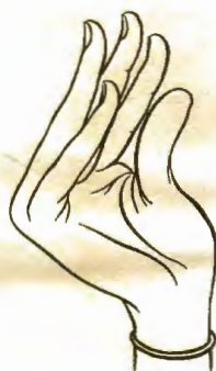
D. Padmakōśa hand.