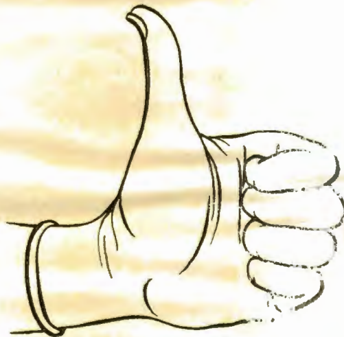
D. Śikhara hand